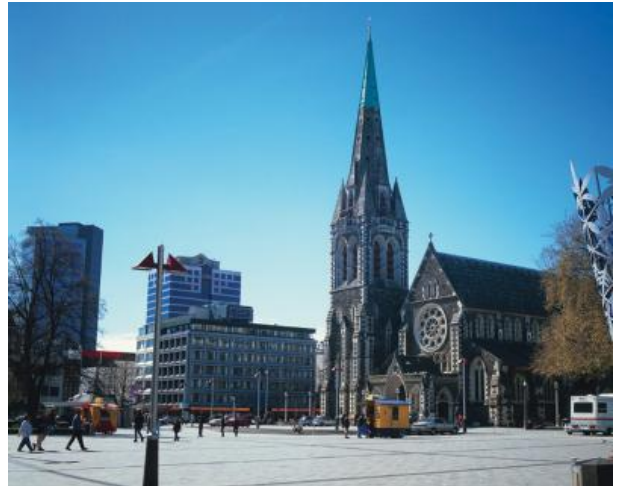
Christchurch: Cathedral Square

of Gothic Revival architecture. Tree-lined avenues, extensive leafy parks and the Avon River give the city an elegant, rather English atmosphere. Other central city attractions include the beautiful Neo-Gothic Arts Centre and its craft markets, the new Art Gallery, Botanic Gardens, a historic tram route through the city, the International Antarctic Centre and the Christchurch Gondola, which offers great views of the Pacific Ocean, city and Southern Alps. The harbour side town of Lyttelton and the picturesque French settlement of Akaroa on nearby Banks Peninsula are also worth a visit.