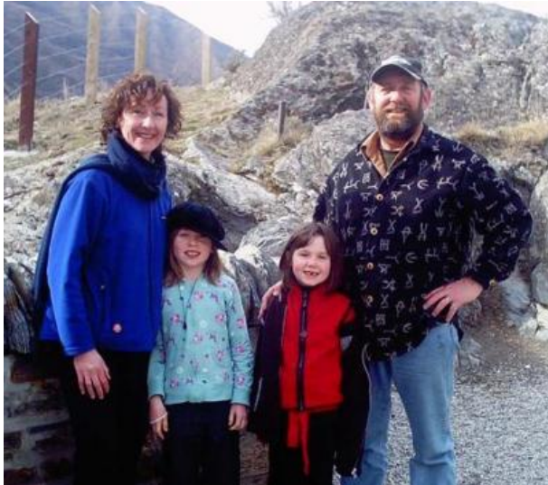
Hosts in Wanaka: The guide and his family