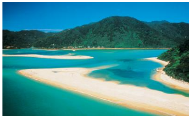
Abel Tasman National Park

The Nelson region is known for its year-round sunshine, golden beaches, national parks, boutique wineries, micro breweries, locally grown produce and a large creative community of working artists. From the city of Nelson it is easy to access any of three National Parks: Nelson Lakes, Kahurangi and Abel Tasman National Park, the latter of which is known for its glittering golden sand beaches, turquoise waters and spectacular ocean views. Regular water taxis provide easy access to the park for those who want to enjoy a daytrip to explore part of the Abel Tasman Coastal Track which normally takes three to five days to walk. For those who wish to explore the coastline from the perspective of the sea, there are sea kayaks available for hire.