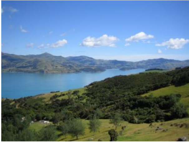
Akaroa Harbour on Banks Peninsula