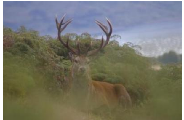
Stag in thick brush

During the red deer hunt guests stay at the family's lodge near Lake Wanaka. The drive to the nearby hunting grounds takes 25 minutes. Hunters then venture into the mountain wilderness on foot. The guides and hunters often take breaks on the high ridges to enjoy the stunning views of the landscapes below. As one would expect at that altitude, vegetation is rather sparse. Much of the 30,000 acre hunting grounds is covered by steppe or bushland. Depending on weather conditions and roaming patterns, various species of wild game can be hunted on the Southern Island.