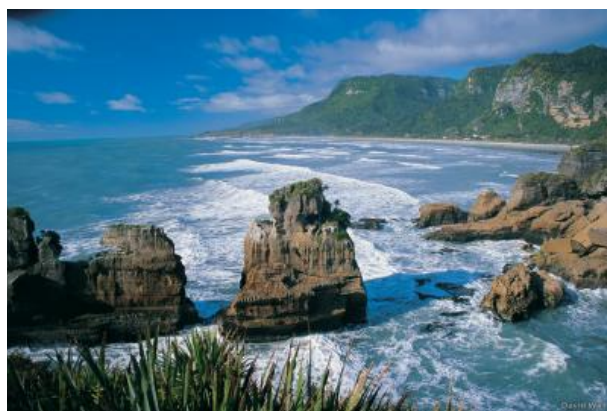
The Pancake Rocks in Punakaiki

Coast Road. Located between Westport and Greymouth, the Paparoa National Park is memorable for its famous Pancake Rocks, a wild coastline, lush rainforest, bizarre limestone landscapes and caves that allow for underground rafting. In the townships of Westport, Greymouth and Hokitika, visitors can learn about the historic gold rush, the coal mining and the life of the early settlers. A range of local craft galleries exhibit hand blown glass, gold nugget jewellery, wood craft and New Zealand jade, known as Greenstone or Pounamu - a local treasure sourced from the West Coast's raging mountain rivers. Greymouth is also the terminus for the scenic TranzAlpine rail journey, from Christchurch across the Southern Alps. South of Greymouth is Hokitika, which was first settled in 1860, after the discovery of gold on the west coast. It still has the feel of a 'frontier town', and there are some lovely old buildings to admire. Greenstone is the town's treasure these days - visitors can see it being polished and sculpted.