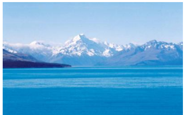
Mount Cook and Lake Pukaki

The dramatic Lindis Pass links the Mackenzie Basin with Central Otago. These stark and uncompromising landscapes have a beauty all of their own - allow plenty of time to stop and take photos along the way. Glimpses of the towering Southern Alps may look familiar - they were used as the Misty Mountains surrounding Rivendell in Peter Jackson's film "The Lord of the Rings." Before the highway reaches Lake Tekapo, those with lots of time can take a detour to Mount Cook Village, which is located a 45min drive away - at the end of the valley. The road first hugs the edge of Lake Pukaki. The exquisite opaque turquoise colour of this lake and others in the area is caused by fine, glacier-ground rock particles held in suspension. The landscape is a mixture of high country tussock, farmland and snow-capped mountains.