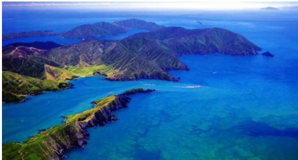
Submerged river system: Marlborough Sounds

In the northeast of South Island are the Marlborough Sounds, a unique landscape of water arms, mountain ridges and indigenous forests. The coastal landscape was shaped by the rise of the sea level and the melting of the glaciers, submerging a number of rivers in the sea. On account of numerous water arms the Sounds can hardly be made accessible by roads and boats are therefore the main means of transport. The area is known to have the longest lasting sunshine periods and is therefore an attractive holiday destination. The best known hiking trail in the Sounds is the Queen Charlotte Sound Hiking Trail