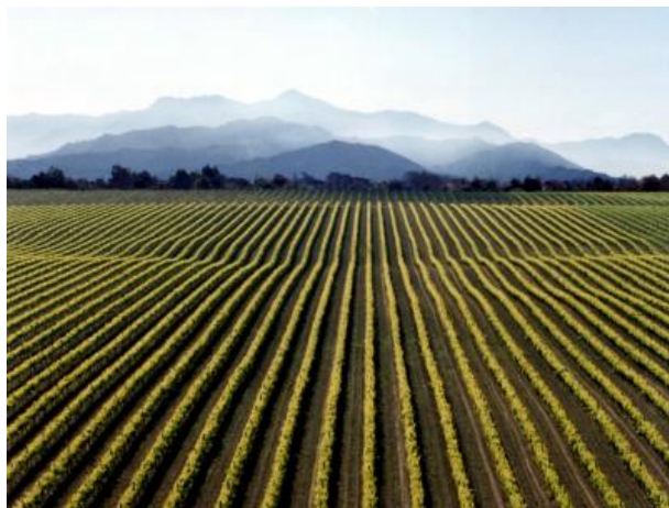
Vineyards near Blenheim

South Island. It is New Zealand's largest grape growing and wine making region with 65 wineries, 290 grape growers and 4054 hectares in grape production. Nearly all of the wineries welcome visitors for tasting sessions and many have a cafe or restaurant on site. Sauvignon Blanc is the region's specialty, but wines made with Chardonnay, Riesling, Pinot Noir, Pinot Gris and Cabernet Sauvignon grapes are also highly acclaimed. Wine trail maps make it easy to find your way around the vineyards. From Rai Valley, a long scenic and curvy road (mostly gravel) leads you towards French Pass and D'Urville Island - one of the most remote areas of the Marlborough Sounds.