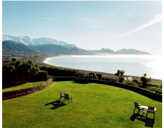
B&B in Kaikoura: offering Mountain & Sea Views

providing a spectacular sight. Garden furniture is provided and breakfast is served in the main house, where the hosts Kerry & Julie live with their children.