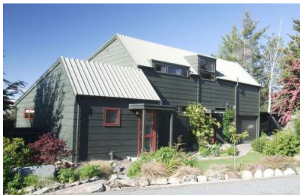
small and personal: B&B at Lake Tekapo