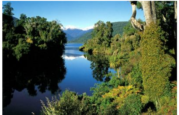
Reflections in Lake Moeraki

viewing platform, a complete circuit of the lake can be completed in one and a half hours. Just north of Haast is Lake Moeraki, a peaceful forest lake with good fishing. The settlement of Haast was once a construction camp for the Ministry of Works (the government department responsible for building the road from Haast to Wanaka, which was only completed in 1965). It's a town with a touch of the wild west - helicopters fly deer hunters into the rugged ranges and local pubs make a feature of stuffed animal trophies. The Haast Visitor Centre offers excellent information on the South Westland World Heritage Area, worth a stop! Haast is also the last fuel stop for a while. The way to the Haast Pass follows the Haast River to its headwaters, it is quite a dramatic road crossing of the Southern Alps - even though it is the lowest of the three alpine passes (563 m).