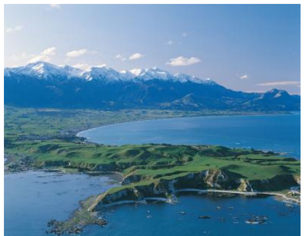
Kaikoura Peninsula - © Whale Watch Kaikoura

Situated midway between Christchurch and Picton, the township of Kaikoura is located on a rocky peninsula protruding from lush farmland beneath the mountains. In the waters off the peninsula, a complex marine system provides an abundantly rich habitat for marine mammals and seabirds making it an ideal place for getting 'close to nature'. A town with its own fascinating history, archaeological remains indicate that Moa Hunters inhabited the peninsula 900 years ago. The Maori name Kaikoura translates to 'meal of crayfish' (Kai - food, koura - crayfish), and it is crayfish for which the region has traditionally been famous. The area's abundant food sources attracted Maori settlement, and the remains of several pa sites can still be explored with a local Maori guide; tours can be arranged by Umfulana. Today, Kaikoura offers a range of eco-tourism oriented activities such as whale watching, dolphin swimming, seal swimming, albatross watching, crayfish diving and star gazing.