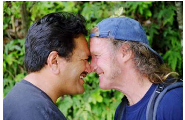
'Hongi' - Traditional Maori Greeting

It is a boutique tour by mini coach where you will learn Maori history and understand how that shapes their fundamental relationship with the environment today. Participants will also Visit ancient Pa sites (fortified villages) of pre European days and hear how they were once settled by our ancestors - often in battle. Later, you will explore one of Kaikoura's bush walkways to learn some of the traditional indigenous uses of the trees and plants as food and medicine and learn a waiata (song) written especially for this tour.