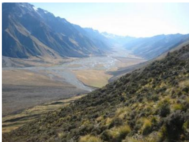
Panoramic view during Tahr hunt in Southern Alps

The free range hunt takes place on private land where there is less hunting pressure and greater trophies. A cottage next to the hunting grounds serves as the accommodation during the mountain adventure. Hunters, guides and (if desired) travelling companions stay at a former sheep shearing hut that was recently converted to a cottage for hunters. Such "Shearers' Quarters" are a typical feature of New Zealand that can be found on nearly all highland ranches. Though not luxurious, the accommodation offers warm showers and comfortable beds.