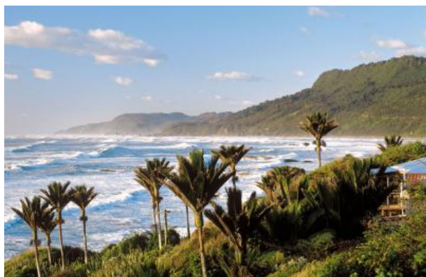
The West Coast of the South Island: remote & rugged

We offer tailor-made tours for individuals, couples, families or small groups of friends. Unlike people traveling in larger groups, you will be able to enjoy touring the country at your leisure, taking routes off the beaten path, avoiding overcrowded tourist attractions and making use of select accommodations denied to larger groups.