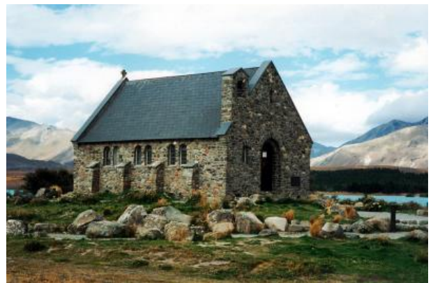
Church of the Good Shepherd on Lake Tekapo