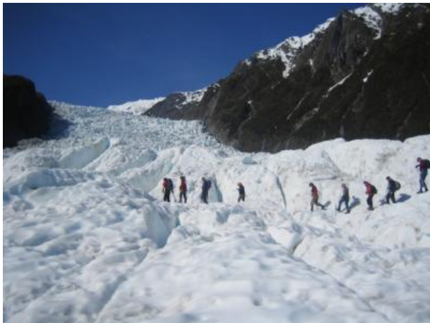
Guided glacier walk: an unforgettable experience

Franz Josef and Fox Glacier are remnants of the ice age, which cascade from vast snowfields of the Southern Alps through West Coast rainforest to valley floors just 300 metres above sea level. Nowhere in the world's temperate zones are glaciers so accessible. These two glaciers move up to four metres every day, which in the glacier world is uncommonly rapid (the Tasman Glacier, on the eastern side of the great divide, moves at only 650 millimetres a day). At the foot of each glacier, the grinding, crushing sounds of ancient ice forcing itself down the time-worn valleys can be heard. A range of companies offer guided excursions to explore the spectacular ice formations. Helicopter and fixed wing aircraft, also provide scenic flights and snow landings, amidst New Zealand's highest peaks, overlooking the glaciers. The terminal face of Fox Glacier is just 5 kilometres from the township that serves it. The road to the walking track crosses ancient moraine from earlier advances and retreats. Fed by four alpine glaciers, Fox Glacier was named after an early New Zealand Prime Minister, William Fox. Lake Matheson lies just 6km from Fox Glacier. On a still, clear day it reflects the unforgettable image of New Zealand's highest peaks, Aoraki (Mount Cook) and Mount Tasman. An easy 40 minute walk leads to the first viewing platform, a complete circuit of the lake can be completed in one and a half hours.