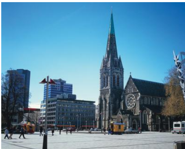
Christchurch: Cathedral Square

Christchurch is the South Island's largest city. In the centre of the city is the Christchurch Cathedral, an outstanding example of Gothic Revival architecture. Tree-lined avenues, extensive leafy parks and the Avon River give the city an elegant, rather English atmosphere. Other central city attractions include the beautiful Neo-Gothic Arts Centre and its craft markets, the new Art Gallery, Botanic Gardens, a historic tram route through the city, the International Antarctic Centre and the Christchurch Gondola, which offers great views of the Pacific Ocean, city and Southern Alps. The harbour side town of Lyttelton and the picturesque French settlement of Akaroa on nearby Banks Peninsula are also worth a visit.