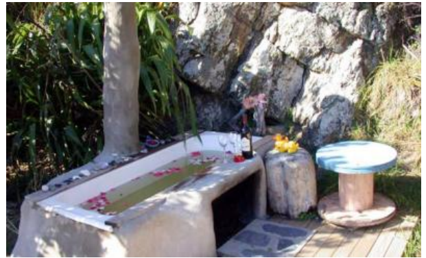
An Unforgettable Experience: New Zealand Outdoor Bath

Situated in a secluded bay in a truly remote part of the Marlborough Sounds, the home of Roger & Jude can only be reached via a scenic but winding 1.5 hour long drive through bush, forest and farmland. The welcoming hosts are spoiling their guests with wonderful meals with fresh seafood, homegrown organic veggies and fruit. The two private cottages for guests are simple but comfortable, peaceful and sunny. Although remote, there are lots of things to do: Boat trips to d'Urville Island, charter boats to see the Sounds, and the mail boat from French Pass which runs once a week. Also, there is a private beach and guests can walk around the coastline and around the hills, or go out in the dinghy with their hosts to catch some fresh fish for dinner. As a special treat, all guests can enjoy a private bath outside under the sun or stars, overlooking the beach, heated by fire, prepared by Roger or Jude. This accommodation is an ideal place to take a break while travelling around the country.