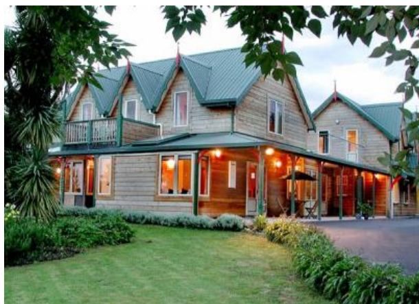
Country Homestead near Greymouth

Only 10 minutes away from Hokitika and 20 minutes south of Greymouth, this peaceful and private coastal country retreat is set in extensive gardens featuring natives and conservation planting including traditional flax gardens. Guest will be warmly welcomed by the Te Rakau family at their colonial-style homestead, to experience wood stove warmth, a private outdoor spa and country cooking. Hosts Pauline & Hemi are happy to share their Maori and European cultural and historic knowledge of the site and the area. Accommodation comprises three ensuite bedrooms in the house as well as a separate self-contained apartment with a further two guestrooms. French doors open from all bedrooms onto the verandahs. Self-catering is optional for apartment guests. Free-range chickens provide farm-fresh eggs every day. Tours, such as scenic flights, hunting, fishing and bird-watching can be arranged. Award-winning cafés and the studios of greenstone, gold, wood, pottery and fibre artists can be visited nearby.