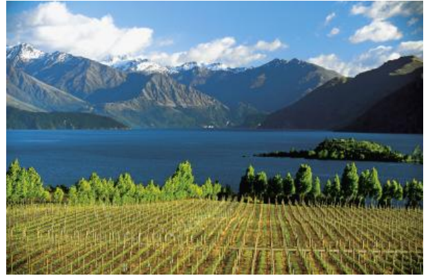
Wanaka: The Rippon Vineyard

The crystal-clear waters of Lake Wanaka reflect the snow-capped peaks of Mount Aspiring National Park. Here one can absorb the unstoppable beauty of pristine wilderness, and know that it will be easy to find a great restaurant for dinner. Embraced by the Southern Alps, on the southern shores of Lake Wanaka, there is Wanaka township, Otago's second resort town after Queenstown. Lake Wanaka is a playground for sailors, water-skiers, kayakers, while the mountains offer great opportunities for mountaineers, climbers, hikers, hunters and snow lovers. The region offers superb brown and rainbow trout fishing and there is a selection of award-winning vineyards within easy travelling distance of Wanaka township. An elevated golf course overlooks Lake Wanaka, with its clear blue water and surrounding alpine vista providing plenty of excuses for a poor round. The seasons are particularly noticeable in Wanaka. Spring (October - December) brings an abundance of blossom. Summer brings cloudless, hot, sunny days (January - March). Autumn brings splendid colours of gold and red (April - June), Winter brings crisp days, and snow lovers can enjoy huge freedom the mountain slopes (July - September).