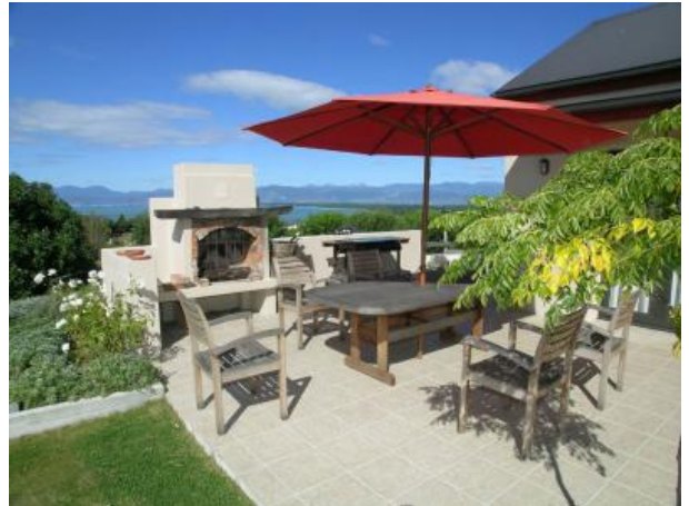
overlooking Tasman Bay: B&B near Nelson

the few remaining apple and pear orchards are wineries, vineyards, olive groves and pockets of farmland. Good restaurants are nearby and the city of Nelson is half an hour away.