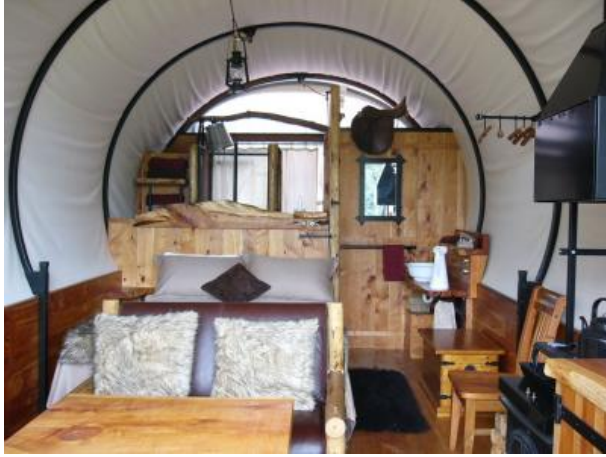
Interior Design: modern, clever & eco-friendly

The wagon has been placed in a beautiful setting near Christchurch with views of farmland where deer, cattle and sheep graze. The Southern Alps are visible in the distance on clear days. Various restaurants are located in the vicinity, and downtown Christchurch is only a 15 minute drive away.