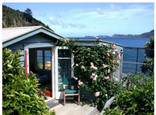
Idyllic: Garden Cottage overlooking the Sea

Please note: The standard of accommodation is different to other accommodation we use in that although it is very comfortable, it is not luxurious. There are two simple and charming separate cottages for guests. The one close to the house has a spacious bedroom and a balcony upstairs, and a private bathroom with an eco-composting-toilet and a shower downstairs. The one below the house is nestled in the garden, overlooking the beach and the sea. It is more romantic but it has an outside eco-composting-toilet and a private bathroom in the main house. Jude & Roger treat their guests as if they were friends, which makes this place very special for many of our clients. "Lord of the Rings" stars, Orlando Bloom and Elijah Woods, have both stayed there and both loved it! However, this kind of accommodation does not suit everybody. Please let us know whether you would like us to include it into your itinerary proposal or whether prefer to stay at a more conventional place.