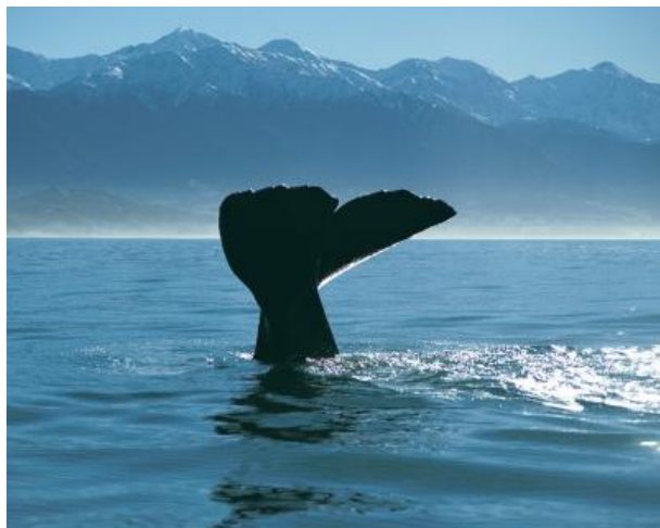
Diving Sperm Whale

Off the coast of Kaikoura village is a marine environment so rich in nutrients that it attracts some of the most magnificent creatures with which we share our planet. Among them the giant Sperm Whale which can grow up to 20 metres in length and has the largest brain of any animal alive. Whalewatch will take one on a breathtaking adventure - right into the world of the whales to meet them face to face. Lucky ones may also be able to see migratory Humpback Whales (June & July), Orca (summer months), New Zealand's own tiny Hector's dolphin, the high spirited displays of the Dusky dolphins, New Zealand Fur seals or the Royal Albatross. As long as weather and sea conditions permit, WhaleWatch offer up to 5 sailings daily, and operate all year round. One should to allow 3.5 hours for the WhaleWatch experience. Between 2 and 2.5 hours are spent on the water, with the extra hour covering report time and transport to and from the boat. Whale Watch Kaikoura Limited is a community trust owned by the Maori people of Kaikoura in partnership with their affiliated tribal people, the Ngai Tahu. They are proud of their many tourism awards, commitment to education and their affiliations with international organisations involved in the research of marine life in the Kaikoura Trench.