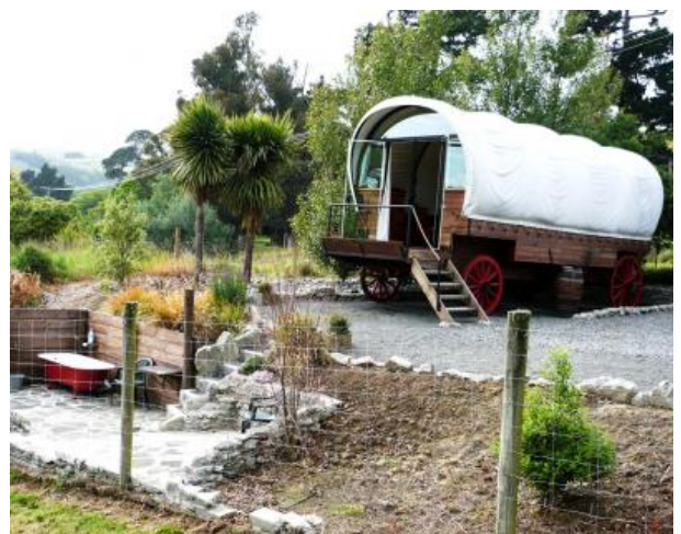
Romantic, unique & luxurious: Wagonstay near Christchurch

This unique luxury accommodation consists of a covered wagon modelled after the wagons used by early settlers in New Zealand. Modern amenities expected by 21st century travellers have been discretely added, including a kitchenette with a microwave oven and refrigerator, heating and air conditioning, a bathroom with a computer controlled shower, and much more.