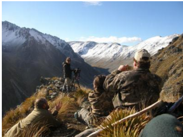
Observing a Tahr

grounds of the Tahr and 25 minutes from those of the Red Stag. A travelling companion who is not participating in the hunt will be well looked after by the host family and can take excursions from Lake Wanaka to various fascinating destinations. The adventure metropolis Queenstown is just an hour's drive away, while Milford Sound in Fjordland National Park can be reached from Wanaka by small aircraft.